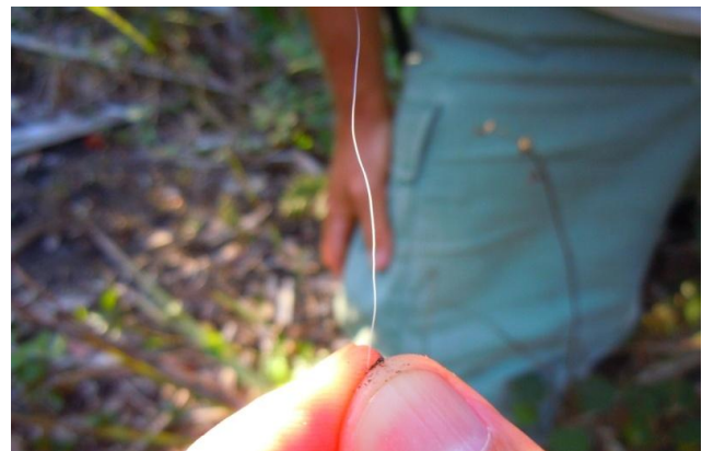
Upper: Picking through the flattened leaves and trampled soil of a panther daybed to find hairs or paw prints for verification. Lower: A white hair from FP183's belly: hard (soft) evidence of a bed site.

Florida Panthers hunt at dawn and dusk. They rush short distances and spring at their prey. They kill by a bite to the neck or skull. An adult male typically consumes larger-sized prey (e.g., white-tailed deer) every 8 to 11 days, while an adult female with kittens may consume large prey more often. After the first meals, panthers "cache" their prey by putting debris over the carcass. Panthers may return to feed on the same carcass over several days until they are ready to move on or the carcass has become too rancid to consume. Currently the Florida Fish and Wildlife Conservation Commission is engaged in a prey study under the direction of Dr. Dave Onorato. Watch for Dave's article with more specifics on the study in the February Panther Update issue.