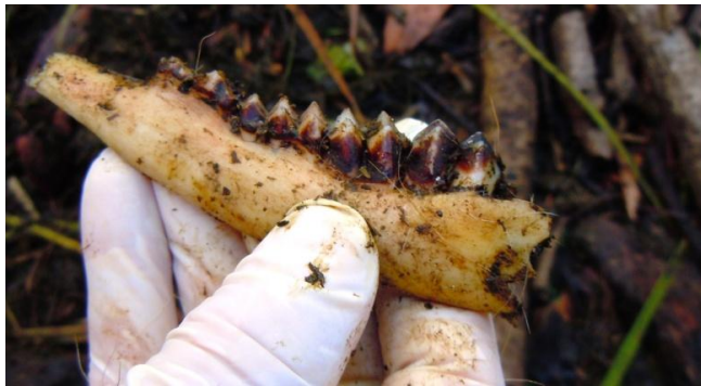
Leftovers from FP194's feast. Studying a deer's tooth eruption and wear can yield clues to its age.